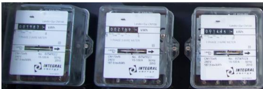
Figure 2: Meters

Note: For a typical household, there are 1 or 2 meters. There are some houses with 3 meters. Relax and simply record all the numbers like this (it is very, very likely that your numbers will be different!):