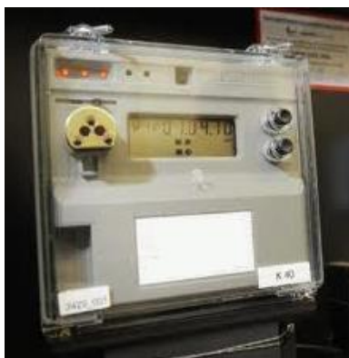
Figure 1: Meter box

Find your meter (usually located outdoor in a metal box attached to the walls, an example is shown in Figure 1) and record all the numbers during sunrise. (You can find sunrise times online, e.g. Google “sunrise time”).